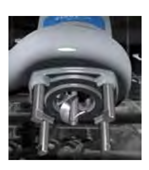
The Flygt feeding screw handles material with a high dry-solid content with ease. Available for 3153.