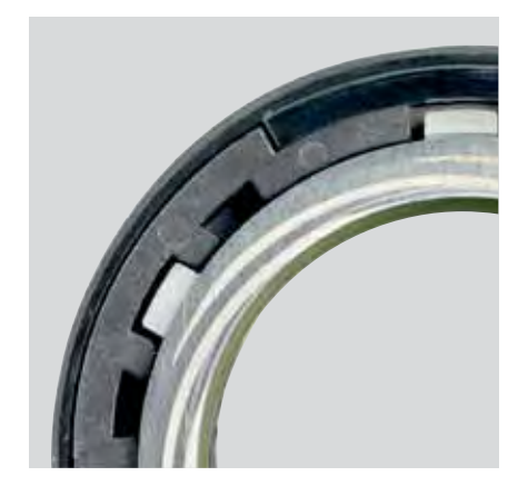
The Active Seal<sup>™</sup> system, a patented zeroleakage double-seal system, actively prevents liquid from entering the motor cavity, thereby reducing the risk for bearing and stator failure.