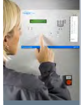
Extensive monitoring and control

We supply hardware and software for complete process systems - from individual pump drives, starters, sensors and controllers to system software and scalable SCADA systems.