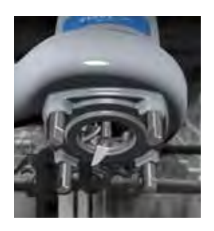
The Flygt cutting knife effortlessly chops food and fish matter, including whole fish, into small, easy-to-pump solids. Available for 3127 and 3153.